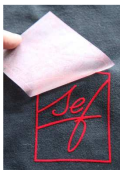
Remove liner, done!

VelCut Premium with polyamide flock is available in 4 fluorescent colours.